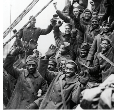
their black country-men," the Tribune continued. And "the ebony warriors" felt it, literally, beneath a hail of chocolate candy, cigarettes, and coins raining down on them from open windows up and down the avenues. It would have been hard to miss

"Never have white Americans accorded so heartfelt and hearty a reception to a contingent of